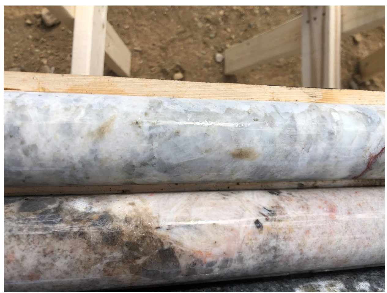
Figure 2 White spodumene at 55 m in the top row and white coarse-grained cleavelandite in the second row, PWM-22-130, West Joe Dyke